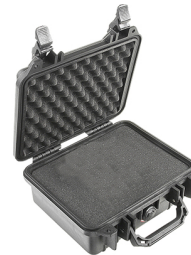
1200WF With Foam