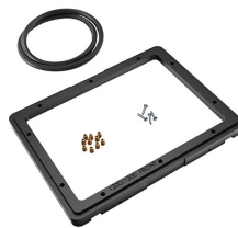
1200PF Special Application Panel Frame