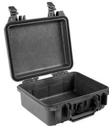
1200NF No Foam