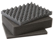
1201 3 pc. Replacement Foam Set