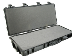
1700WF With Foam