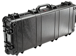
1700NF No Foam