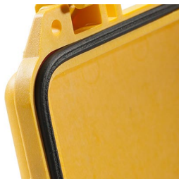
1703 Replacement O-ring